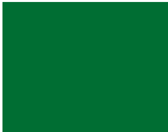
P526 - Aisle Green