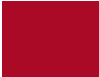
P350 - Safety Red