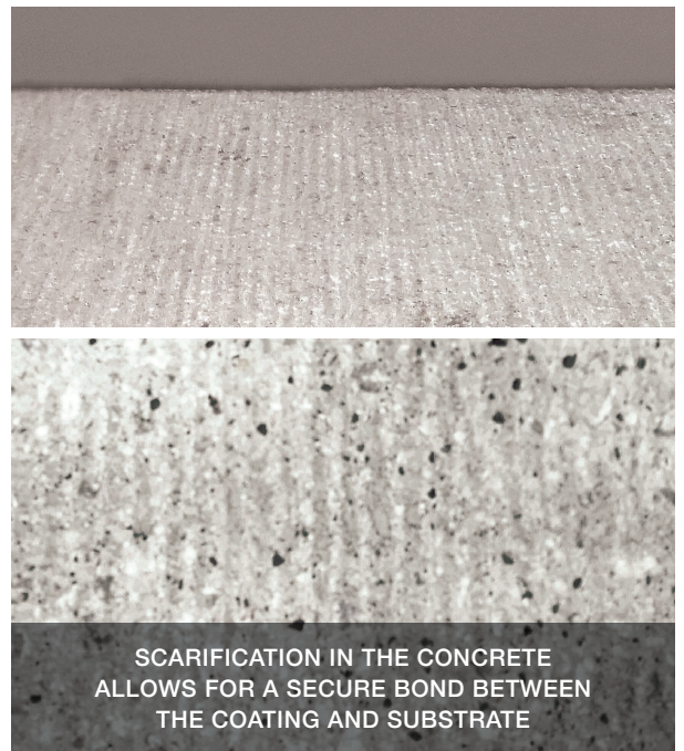
SCARIFICATION IN THE CONCRETE ALLOWS FOR A SECURE BOND BETWEEN THE COATING AND SUBSTRATE

Fortune 500 giants regularly contract our crews because of proven techniques and our flooring systems’ long-term performance.